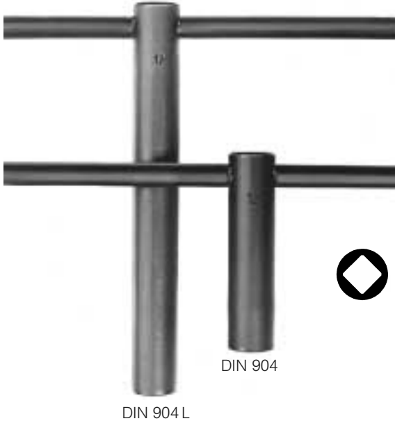
DIN 904 L

Special steel, body and tommy bar hardened and blued .