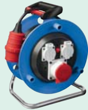
For outdoor use

For usage on construction sites and outdoors, IP 44. Fulfills the requirements of construction sites, workshops and industry.